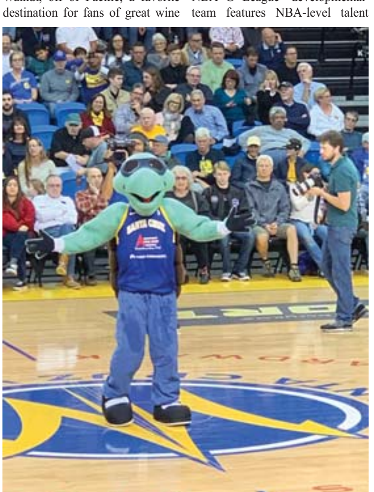
Santa Cruz Warrior mascot Mav'Riks

playing not in a 20,000 seat arena, but in the intimate 2,500 seat Kaiser Permanente Arena, where fans sit within reach of the action and pay a fraction of the price of GSW tickets. (The season runs through